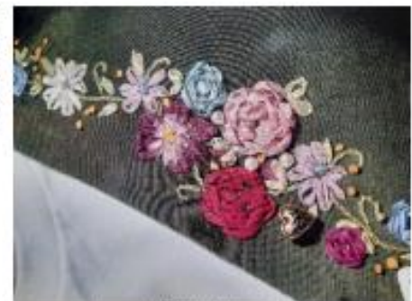
Example of Silk Ribbon Embroidery

Silk ribbon embroidery results in an elegant spray of flowers, animals or an artistic design using silk ribbon instead of thread. Greater space is covered in a shorter time with this technique. Women's undergarments as well as wedding attire would have this fancy style of stitching.