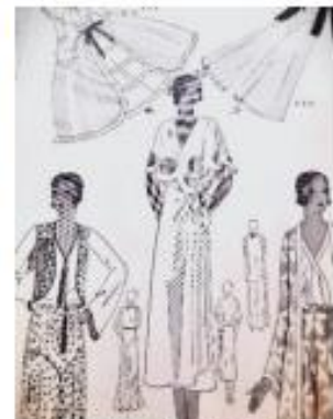
Delineator December 1930

Applique' is the process of layering a fabric design on a foundation fabric with raw edges covered by thread of the same color to finish it. This technique lends itself to children's clothes, a young woman's afternoon dress, sporting attire, and some lingerie. The photo to the left shows a child's cotton suit has a cute rabbit for summer fun.