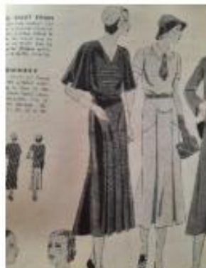
Delineator May 1931