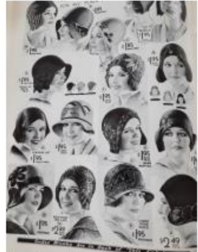
Sears Roebuck Catalogue 1930

Patchwork is the technique of joining pieces of fabric together with decorative embroidery stitches.