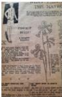
Pictorial Patterns June 1931

During the Model A Era, hand stitching was seen mostly on women's and children's clothes. Many household items were also decorated with hand stitching. Stitching designs were the result of creative artisans using thread made of cotton, silk, wool, and even linen. Model A Era stitchers used various stitching techniques to add charm, glamor, elegance, and an element of desirability to their garments.