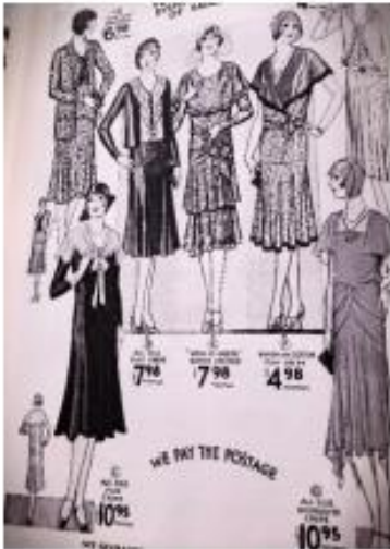
Sear's Catalogue 1930

Tatting is lace made with a small hand shuttle, thread, and skillful hands. This type of lace could be used on cuffs, collars, and afternoon dresses. Household items such as pillowcases and handkerchiefs were often treasured if they had tatting. In the photo to the left, the black dress with the white bertha collar has delicate tatting as lace around the collar and cuffs.