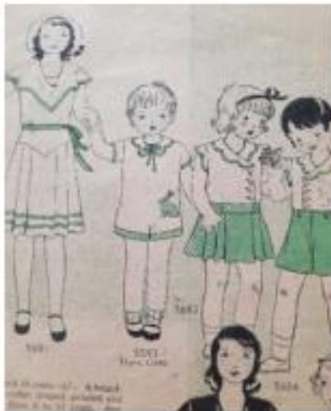
Pictorial Patterns June 1930

Applique' is the process of layering a fabric design on a foundation fabric with raw edges covered by thread of the same color to finish it. This technique lends itself to children's clothes, a young woman's afternoon dress, sporting attire, and some lingerie. The photo to the left shows a child's cotton suit has a cute rabbit for summer fun.