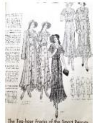
The Tea-hour Frocks of the Smart Resorts Delineator January 1931

Picot edging appeared on summer frocks of sheer fabric requiring a fine edging, as did many pieces of alluring lingerie. The hemlines of the summer frocks in the photo have a picot edging, done on a commercial machine.