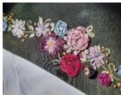
Example of Silk Ribbon Embroidery

Silk ribbon embroidery results in an elegant spray of flowers, animals or an artistic design using silk ribbon instead of thread. Greater space is covered in a shorter time with this technique. Women's undergarments as well as wedding attire would have this fancy style of stitching.