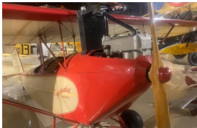
This airplane, on display in the OshKosh Museum, has a Model A engine installed in it.