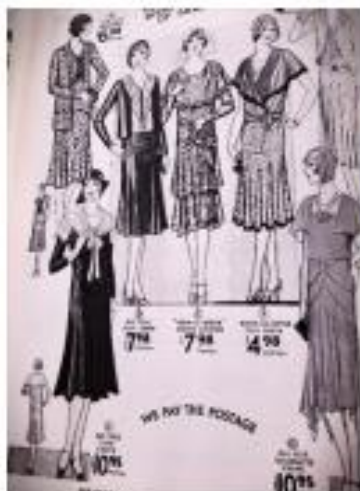
Sear's Catalogue 1930

Tatting is lace made with a small hand shuttle, thread, and skillful hands. This type of lace could be used on cuffs, collars, and afternoon dresses. Household items such as pillowcases and handkerchiefs were often treasured if they had tatting. In the photo to the left, the black dress with the white bertha collar has delicate tatting as lace around the collar and cuffs.