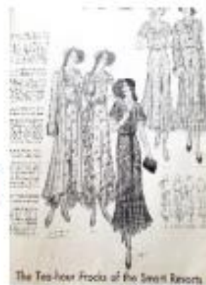
The Tea-hour frocks of the Sweet Resorts Delineator January 1931

Tatting is lace made with a small hand shuttle, thread, and skillful hands. This type of lace could be used on cuffs, collars, and afternoon dresses. Household items such as pillowcases and handkerchiefs were often treasured if they had tatting. In the photo to the left, the black dress with the white bertha collar has delicate tatting as lace around the collar and cuffs.