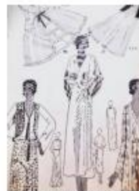
Delineator December 1930

Applique' is the process of layering a fabric design on a foundation fabric with raw edges covered by thread of the same color to finish it. This technique lends itself to children's clothes, a young woman's afternoon dress, sporting attire, and some lingerie. The photo to the left shows a child's cotton suit has a cute rabbit for summer fun.