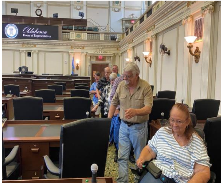
Touring the Oklahoma House Chamber