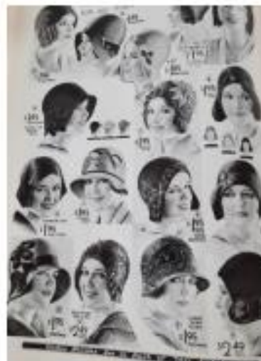
Sears Roebuck Catalogue 1930

Patchwork is the technique of joining pieces of fabric together with decorative embroidery stitches.