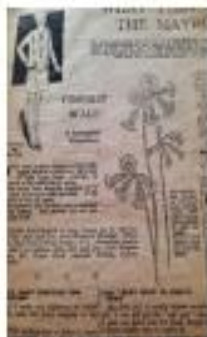
Pictorial Patterns June 1931

During the Model A Era, hand stitching was seen mostly on women's and children's clothes. Many household items were also decorated with hand stitching. Stitching designs were the result of creative artisans using thread made of cotton, silk, wool, and even linen. Model A Era stitchers used various stitching techniques to add charm, glamor, elegance, and an element of desirability to their garments.