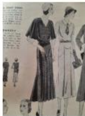
Delineator May 1931