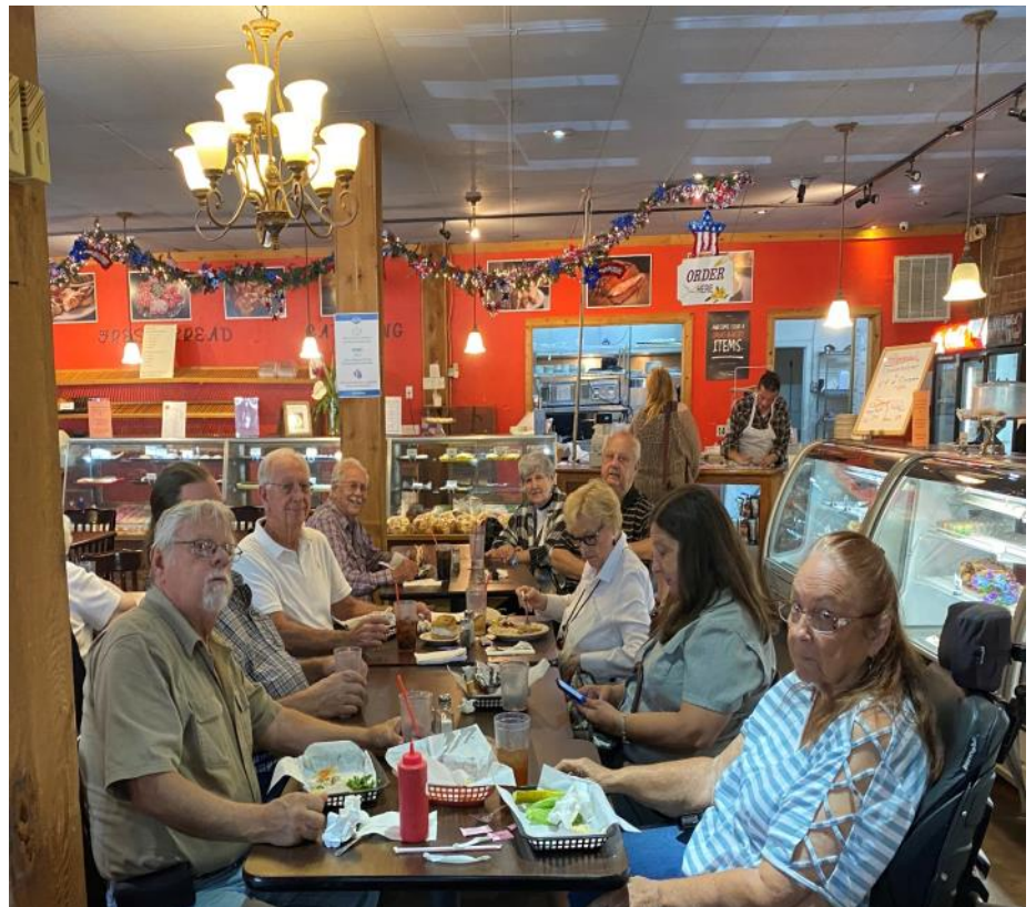
Lunch at Ingrid's