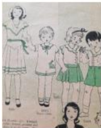
Pictorial Patterns June 1930

Applique' is the process of layering a fabric design on a foundation fabric with raw edges covered by thread of the same color to finish it. This technique lends itself to children's clothes, a young woman's afternoon dress, sporting attire, and some lingerie. The photo to the left shows a child's cotton suit has a cute rabbit for summer fun.