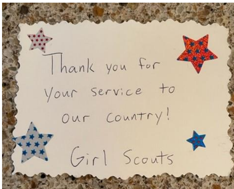
A picture of the card is copied here so you can smile too.

The card came home with me and I put it on the refrigerator next to the pictures drawn by the grand-daughters. The card is still on the refrigerator and I still smile when I look at it.