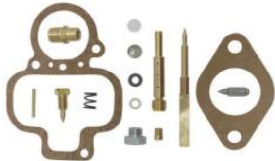
Marvel Shebler Model A or B