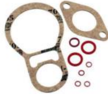
Tillotson Model A