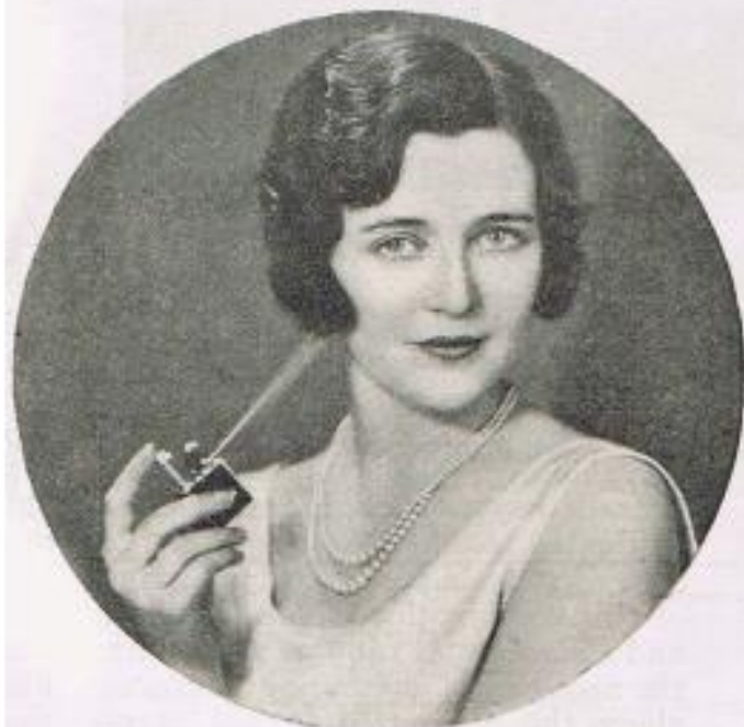
Resembling a cigarette lighter, this little atomizer sprays a fine jet of perfume when a plunger is pressed.

S PRAYING a tiny jet of perfume when its plunger is pushed down, a novel atomizer resembling a cigarette lighter in appearance may be carried in a woman's hand bag, it is said, without danger of spilling its contents. Its nozzle is covered with a cap which is released by a plunger. When the apparatus is closed, a groove in the plunger fits over the cap to hold it in place, while the plunger in turn must be pressed down before the cap can move. Thus, its inventors claim, the device is made air-tight and proof against leakage. To operate the atomizer, one need only press the plunger twice—once to release the cap and the second time to eject the spray of perfume. The atomizer is manufactured in two sizes—for carrying in the hand bag and for the dresser.