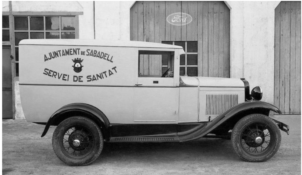
This 1930 Model A has bodywork made in Sabadell (Barcelona) by the company "Carrocerias CABA" for the Health Service of the Sabadell City Council. The vehicle lettering is not in Spanish, but is in Catalan, a regional language.

Photos that are at least 250KB in size work the best.