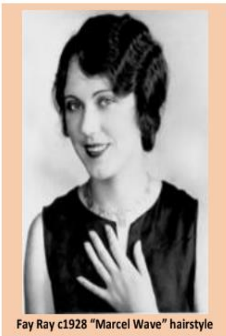
Fay Ray c1928 "Marcel Wave" hairstyle

Vina Fay Wray (1907-2004), a beautiful Canadian actress, developed her career in the United States and gained international recognition for her portrayal of the leading female role in King Kong (1933)