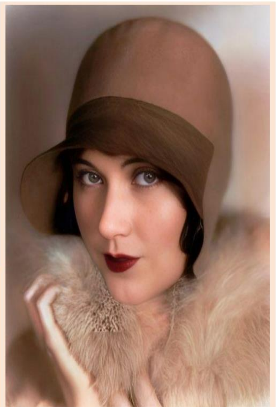
C. 1928 - BEFORE BEING KING KONG'S BRIDE

Vina Fay Wray (September 15, 1907 – August 8, 2004) was a Canadian-American actress best known for her role as Ann Darrow in the 1933 film King Kong . Through an acting career that spanned nearly six decades, Wray attained international recognition as an actress in horror films. She has been dubbed one of the early "scream queens."