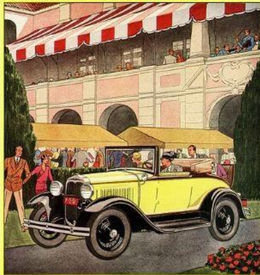
The New Ford Convertible Cabriolet